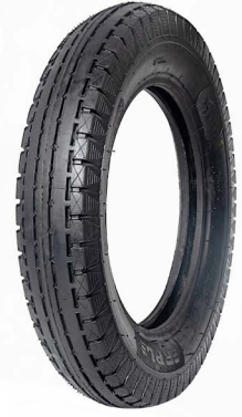
BHIM (6.00 - 19)