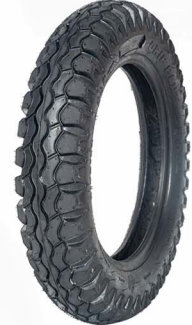
GRIP PLUS (3.75 - 12)