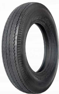
AMAR PLUS (6.00 - 16) (5.60 - 14)