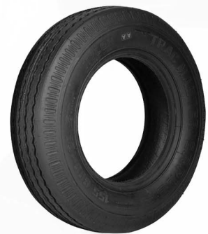
POWERTRACK RIB (155D80 -12)