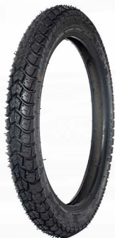
FIGHTER (2.75 - 18)