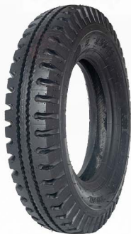
RIB MASTER (5.00 - 12) (6.00 - 16)