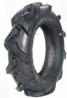
SAMRAT (4.00 - 8)(4.00 - 10)