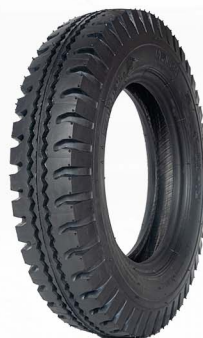
SEMI LUG (5.00 - 12)