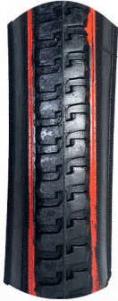
ROAD FIGHTER PLUS 28 - 1.1/2 (10 PR)