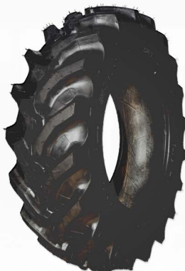
SHOORVEER (14.9 - 28)(13.6 - 28) (12.4 - 28)