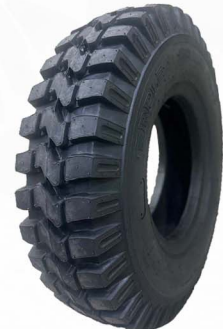
SHAKTI PLUS (9.00-16)