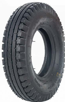
AFLATOON (4.00 - 8)