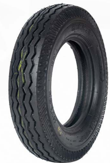
RM.XL -HERO (4.50 - 12)