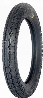
TARZAN (3.25 - 16) (3.00 - 17)