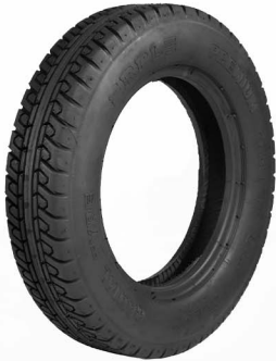
PREMIUM (1.35-10)(4.59-12) (5.65-12)