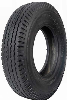
POWERKING (7.00 - 15)