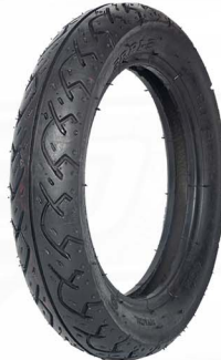
GRAND (90-90 - 12)