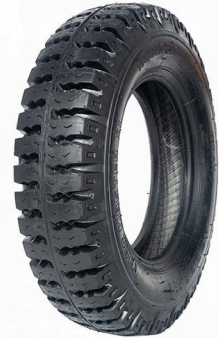
TUFF LUG (185D80-14)