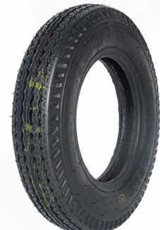
HERO (4.00 - 10)