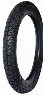
MILAZE POWER (3.00 - 18)(2.75-18) (3.00-17)