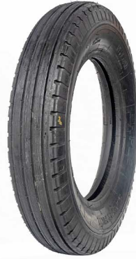
SUPER SHAKTI (7.00 - 19)