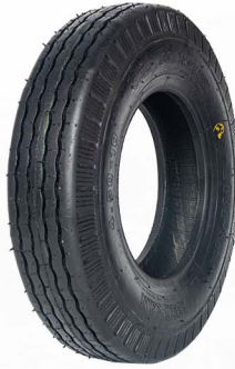
SULTAN (4.50 - 10)