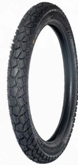
DURA GRIP (3.00 - 18)(2.75 - 18) (3.00- 17)