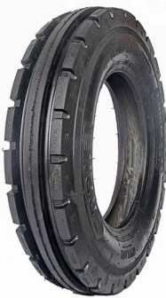
SHOORVEER (6.00 - 16)(7.60 - 16)