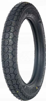
GRIP + (3.00 - 14)