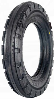
SHOORVEER (500 - 15)