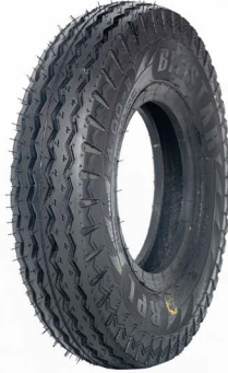
BIGSTAR (4.00 - 8)