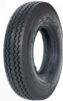
SUPER (4.00 - 8)