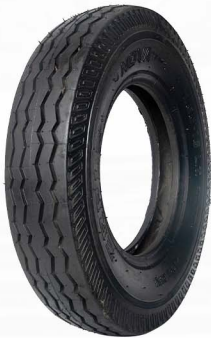
NOVA (7.00 - 16)(6.00-14)