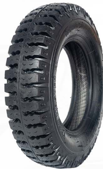
TRACK MASTER (155D80-12)