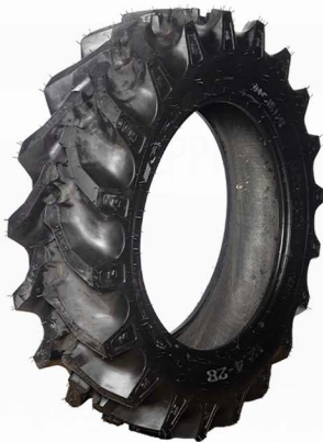
SIKANDER (12.4 - 28)