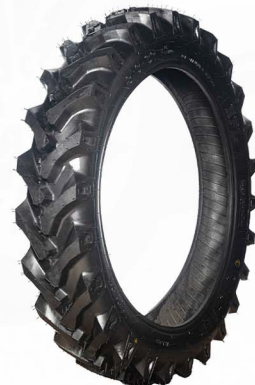
SHOORVEER (8.30 - 36)(8.30 - 32) (8.30 - 18)