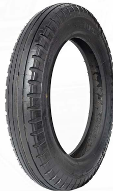
HEERA (5.00 - 19)