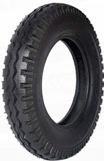
POWER TRACK (5.60 - 14)