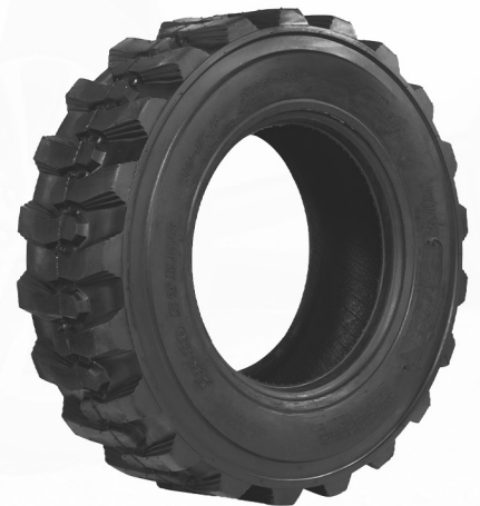
SKID STEER (10-16.5)