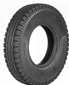
GOLDEN HAWK (4.00-8)