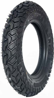
GRAND/POWER (90/100 - 10)(3.00 - 18) (2.75 - 18)(2.75 - 17)