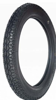
RPL 322 (3.25 - 19)