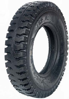
KINGSTAR (4.50 - 10)