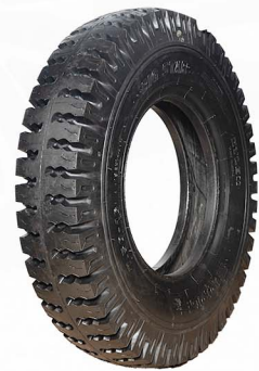
BIG STAR (7.50 - 16)