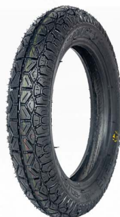
MILAZE POWER (90-90 - 12)(3.75 - 12) (90-100 - 10)