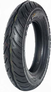
NYLO POWER / GRAND (90/100 - 10)(3.00-10)