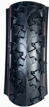
GOLD SUPER 26 - 1.95 (SR)