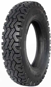
PANTHER PLUS (6.00 - 16)