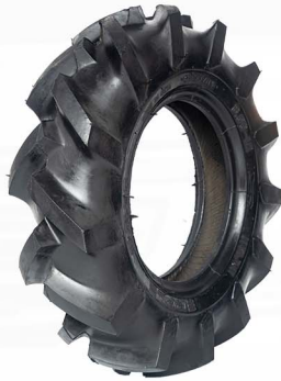
RAJA (6.00 - 12)