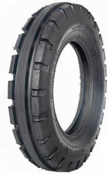
SHAKTI (6.00 - 16)(6.50 - 20)