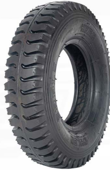
HERO/SUPER LUG (4.00 - 8) (5.20- 14)