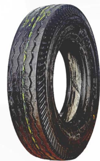
RMXL (7.50 - 16)