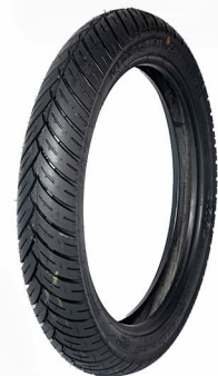
ZAPPER TL (100-90-18) (100-90 - 17)