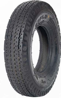
SUPREME (4.00 - 8)