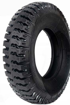
SUPER (7.00 - 15)