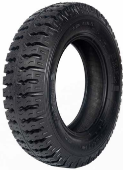
TUFF LUG (195D80 -15)