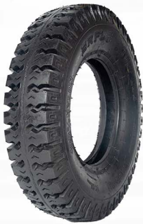
TUFF LUG / SUPER LUG (5.00 - 10)(4.00 - 8)