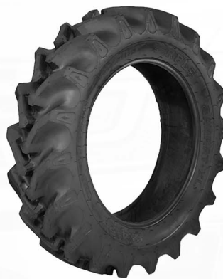
SAMRAT XL (12.4 - 28)