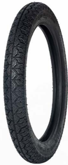
NYLO POWER (2.75 - 18)(3.00-18) (3.00-17)(80-100-17) (80-100-18)