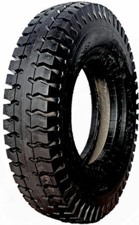
BIGSTAR (10.00 - 20)