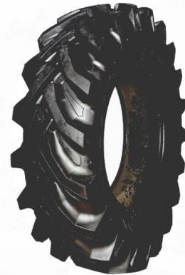
MAHAVEER (13.6 - 28)(16.9 - 28)