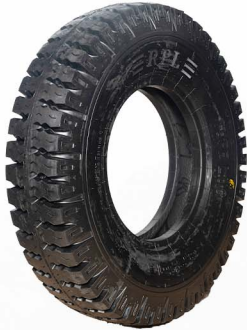
TUFF LUG (8.25 - 16)