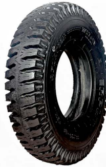
AFLATOON (8.25 - 16)