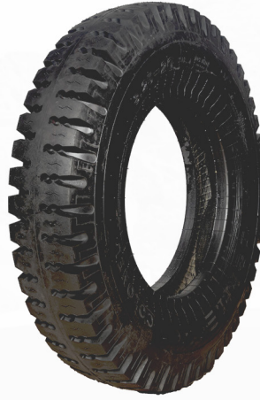
TUFF LUG (10.00 - 20) (8.25 - 20)