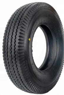
SULTAN (7.50 - 16) (5.20 - 14)