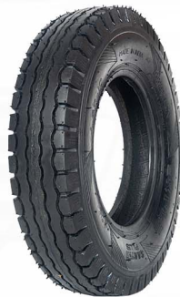
SAATHI (4.50 - 10)