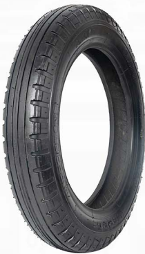
SUPERSTONE (5.00 - 19)