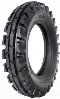
GAZI (6.00 - 16)