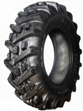
HI-TRAC (16.9 - 28)