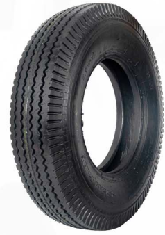
TIGER (7.00 - 15)