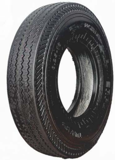
RIB (8.25 - 16)