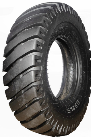
ROCK MINNER (14.00 - 25) (10.00 - 20)