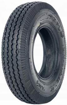
SUPERMILER (4.00 - 8)