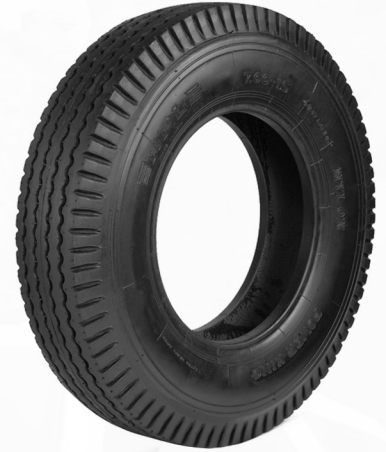
TUFF RIB (11.00 - 20) (12.00 - 20) (10.00 - 20) (9.00 - 20) (8.25 - 20)