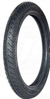
ZAPPER (2.75-18) (2.75 - 17)