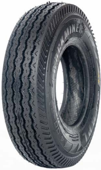
ROCKMINER (4.00 - 8)