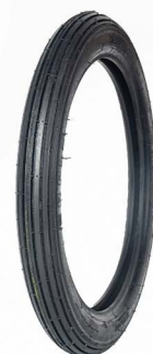
RIB (2.75 - 18) (2.75 - 17)