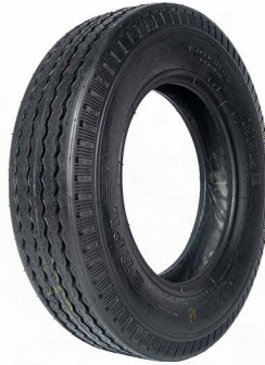
TUFF RIB (185D80-14) (5.90-15)