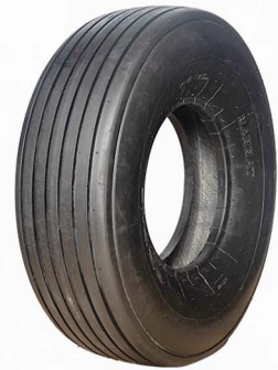
MANNAT (6.00 - 16) (11.00 - 16) (11.00-L-16) (9.00-36)