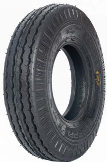
SAFARI (4.00 - 8)