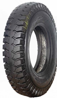
AFLATOON (7.50 - 16) (165D80-13)