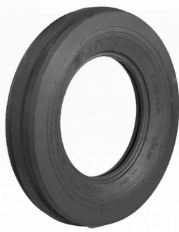
RUSTAM (6.00 - 16)